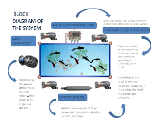
Figure 1: Block Diagram

As provoking the fish to swim across the pond to gain maximum weight is the major priority, we are also installing a wave generator motor to our system (tide level control given) for the fish to swim. To put the limitations faced by a typical fishery system an end. Our idea helps scrutiny the feeding process in aqua-farms[6].