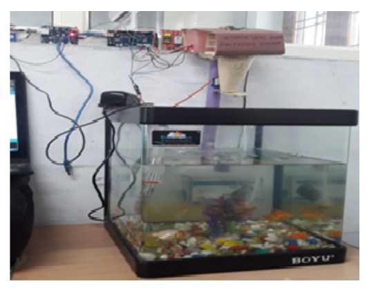
Figure 5: Prototype of Fish feeding system

Prototype of this system is developed and tested to show the results. The below figure 5 shows assembled unit: